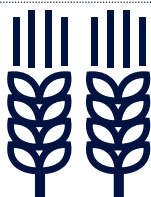
Whole-Grain Cereal, Oats & Pasta