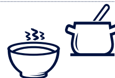
Low Sodium/ No Salt Added Canned Beans & Soup