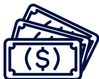
Monetary Donation ($1 could provide up to five meals)