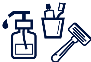
Hygiene Items Feminine Products, Razors