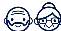
Seniors Nutritional Shakes & Drinks, Adult Hygiene Products

Pop top cans and microwavable cups preferred Please, NO glass items